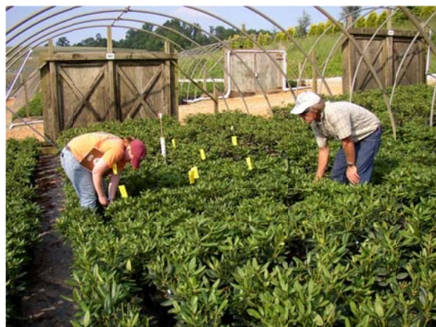
Measuring plant size and spacing while conducting irrigation research at Saunders Brothers Nursery in Piney Valley, VA.